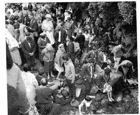
Throughout the week-end groups of people made the pilgrimage up the mountain to the sacred waterfall Te Rere a Kapuni, where church services were held.

A 15 acre 'mushroom village' of tents and caravans housed the gathering at Opunake. As well as church services there were many other activities, including a march past of sports teams, marching girls, football, hockey and basketball teams of all grades, dances, brass band contests, a talent quest, Maori cultural competitions, and sports competitions. Many of those present also visited Parihaka, another of the most revered places in Maori history.